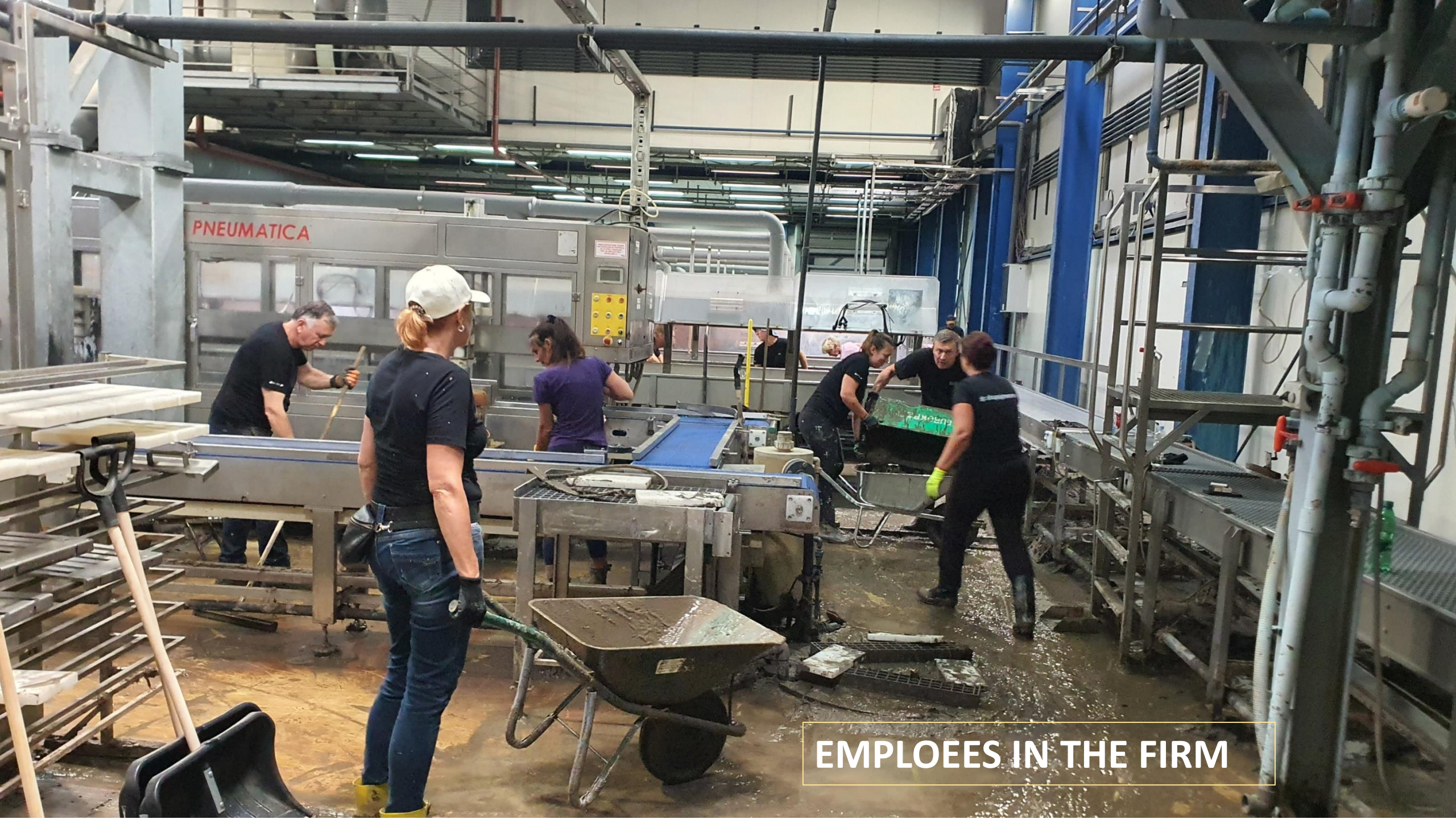
EMPLOEES IN THE FIRM